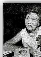
Helen D. Snow Memorial Scholarship