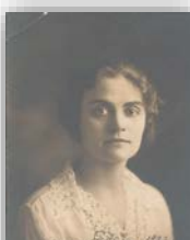
Anna E. Hall Memorial Scholarship