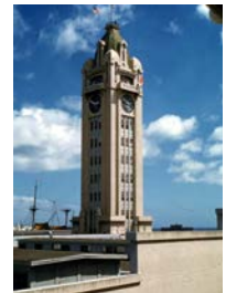
Aloha Tower, Hawaii. Original finish line for the IronMan Triathlon

their hours they need to study, keeping up with family and friends while they study, etc. Instead, I suggest picturing yourself at the “finish line.” You are done with the final; you are relaxed and maybe joyous. Now, mentally turn around and see the things that were obstacles, at the “starting line,”